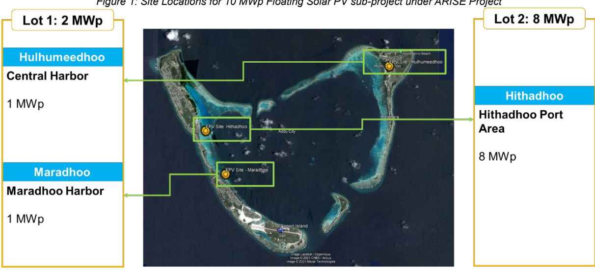
Figure 1: Site Locations for 10 MWp Floating Solar PV sub-project under ARISE Project

The ARISE Project features various sub-projects involving solar PV of various technologies, grid upgrades, Battery Energy Storage Systems (BESS), etc. Each sub-project is procured through an international competitive bidding process. Currently, two sub-projects are being procured - (i) 15 MWp ground mounted solar PV, and (ii) 10 MWp floating solar PV. The tender process is carried out through the Ministry of Finance (MoF) on behalf of the MCCEE.