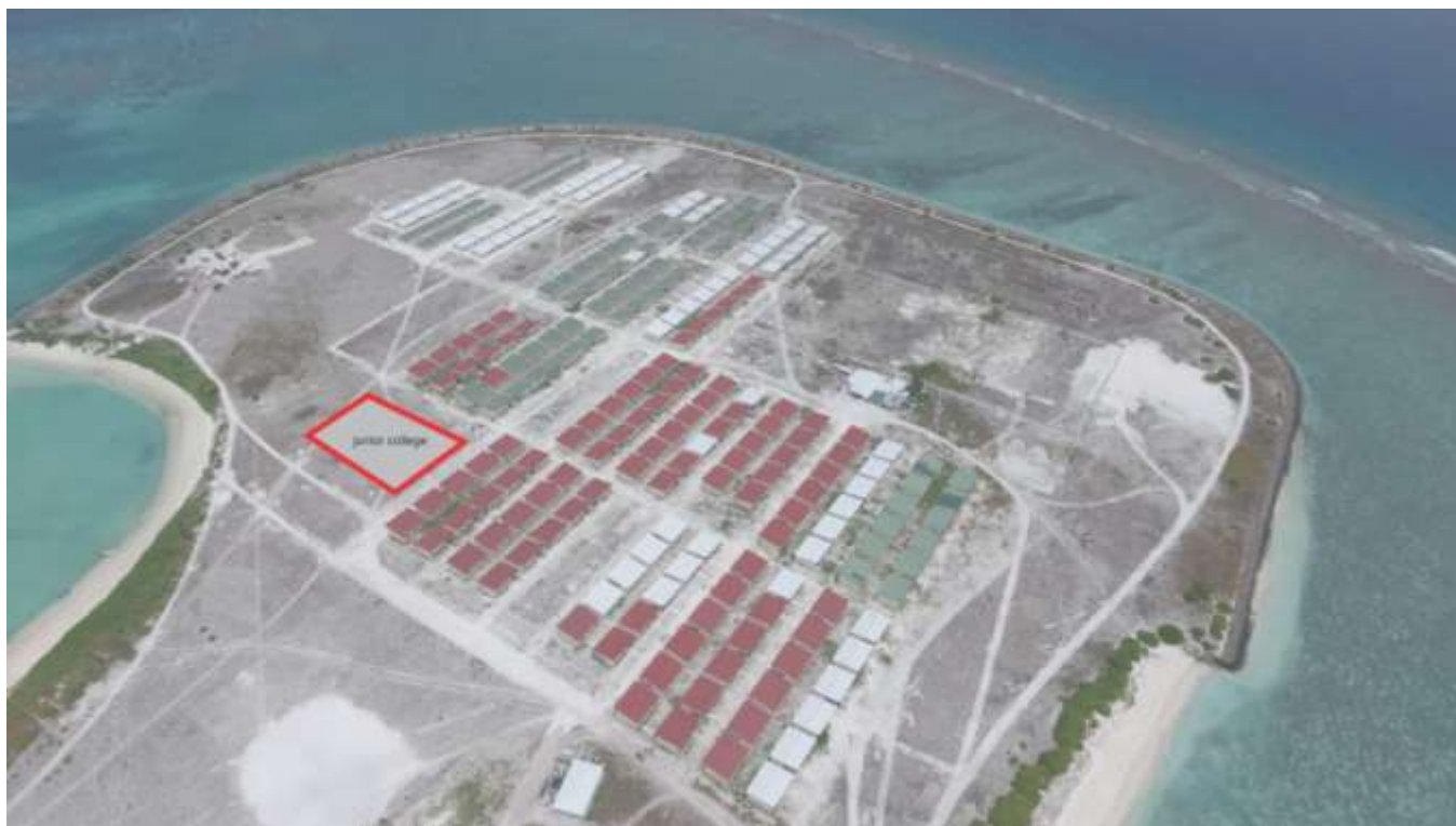
Location of Junior College, HA.Dhidhdhoo

Plot area available for the construction and development of Junior College and Accommodation Block is 30,000 square feet (sq.ft). Under the Public-Private Partnership model, the private partner (an industry representative) may utilize the land area for other revenue generating options, provided that it does not affect the primary goals of these institutes and shall be approved from MoHE.