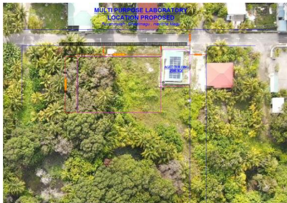
Proposed Location for the Laboratory

MOFAMRA is currently working towards the establishment of a multipurpose laboratory in Fuvahmulaku City. Four laboratories; soil science, plant pathology, entomology and tissue culture will be housed in this newly established laboratory facility. The purpose of this laboratory is to provide accurate and timely advise to farmers for them to make evidence-based decisions. As indicated in the site location plan, the new building is planned to be constructed in the block next to the existing AgroNat Building. Total land area of this 2-floor building, including the single floor greenhouses is 6229.075 Square feet.