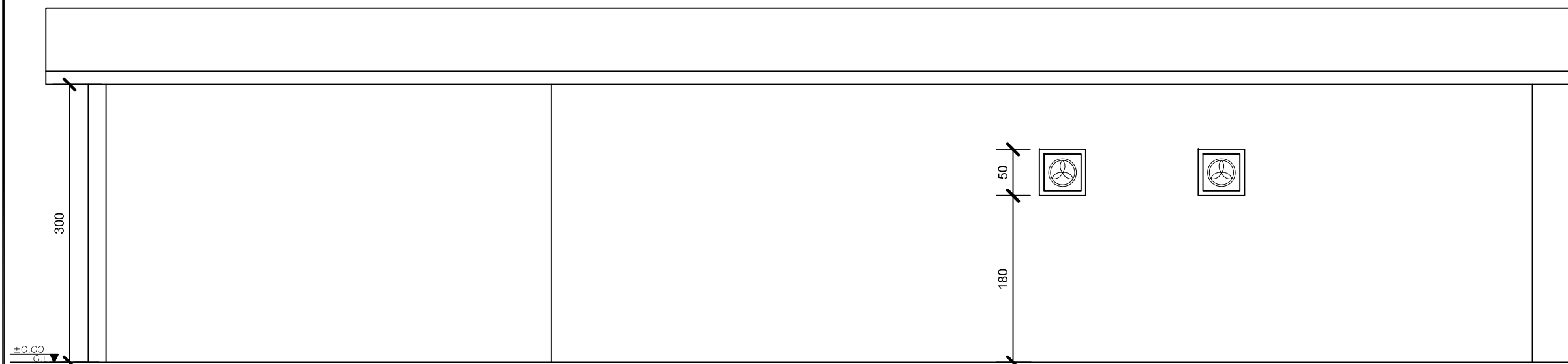
ELEVATION - 2